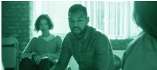
Support Team Leader