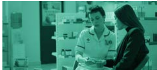
Community Pharmacy Technician